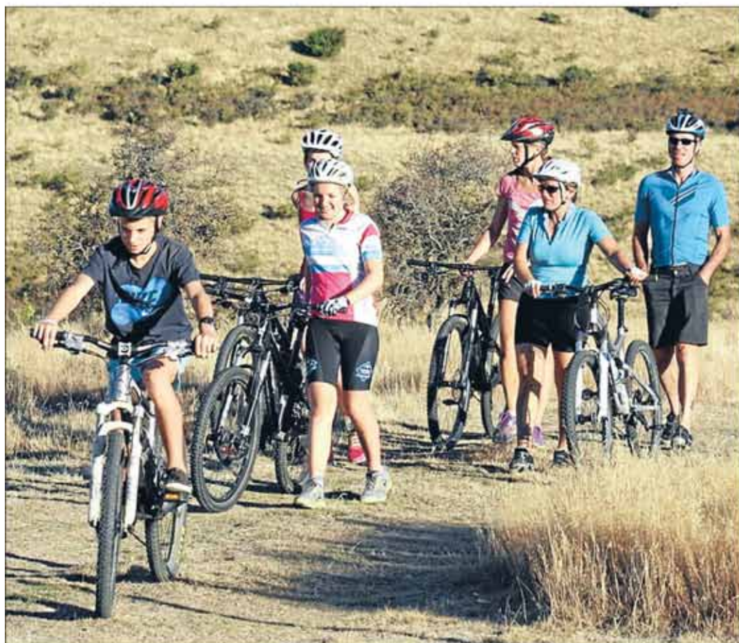
New territory: Mountainbikers test out new Rabbit Ridge trail.