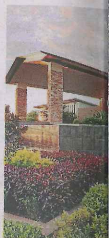
Hunter Valley: Enjoy a

The Port Chalmers Seafood Festival will this year take place on September 21. The event was first held in 2011 alongside Rugby World Cup celebrations and proved a huge success, attracting more than 5000 people. This year it is expected more than 7000 will enjoy the festival's mix of local seafood, brews and regional wines. Music will be provided by Don McGlashan and Lyttelton band The Eastern, with more names yet to be announced. There will also be a police Blue Light disco and a kids' fishing competition, as well as a children's fun zone. "The Port Chalmers Seafood Festival represents a synergy of local history and modern community," says