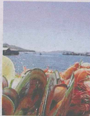
Seafood festival: Tipped to be popular.